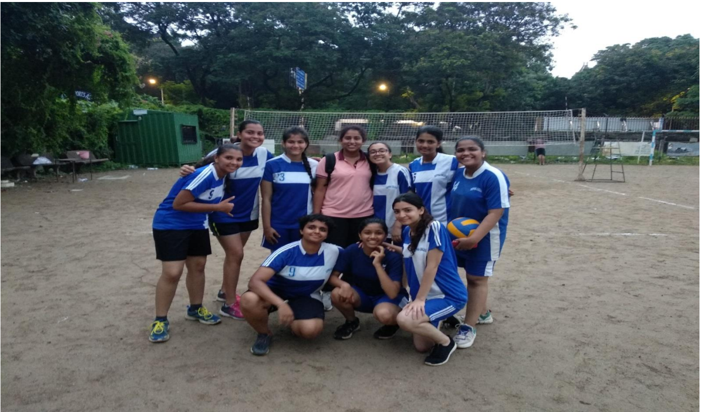
Junior college Volleyball team (2019-20)