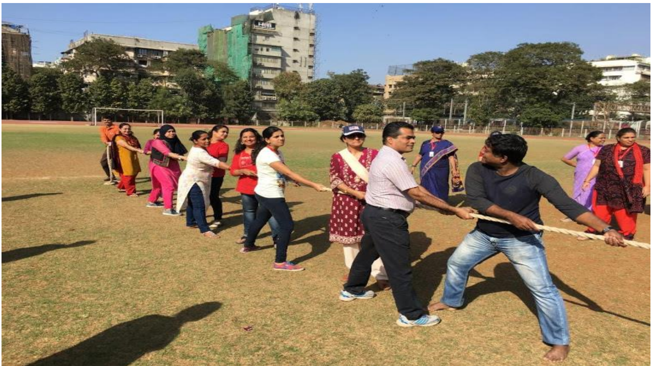
Teachers participated for the Tug of war and other events on Sports Day.