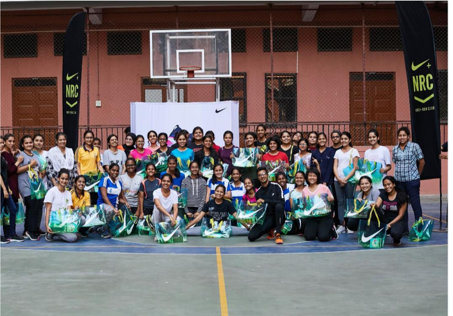
Fitness program organized in collaboration with NIKE at Sophia College (2019)