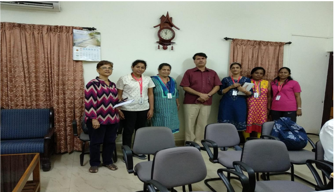
A Meeting for collaborative sports activities between Sophia College and DSYA, Goa.