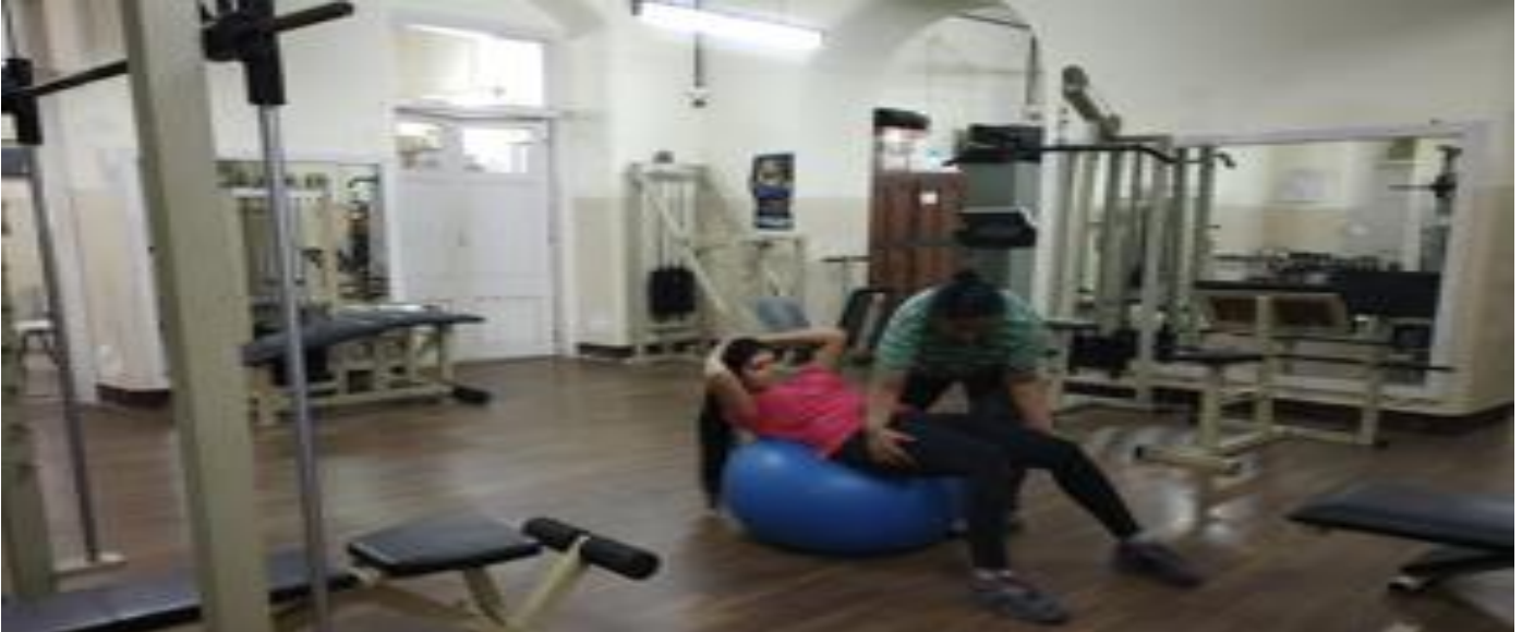
Gym facility is provided by the Gymkhana for all the students