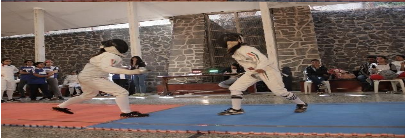
University of Mumbai Inter collegiate fencing competition (M/W) at Sophia College