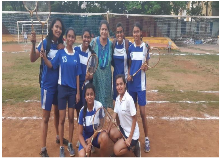
Runner-up basketball team of Fury and Conquer on the left and Ball Badminton team(right) stood second in the DSO Division level tournament.