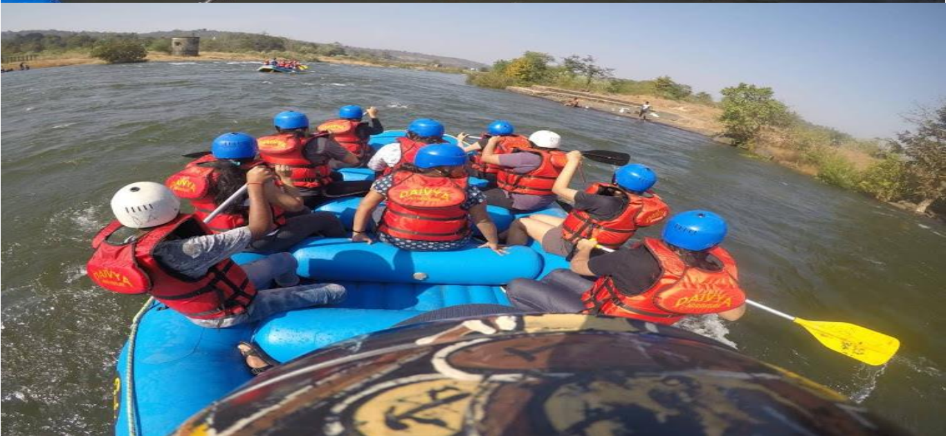
Adventurous sports and camping (2019-20)