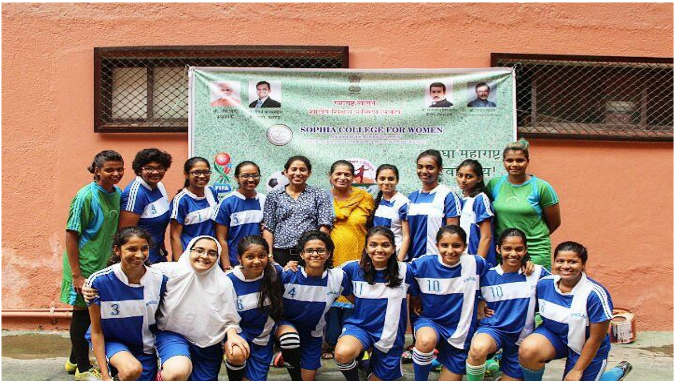
Junior college Football team(2017-18)