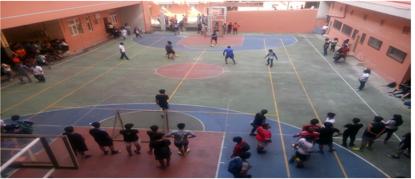
Competition organized during college fest - Kaleidoscope