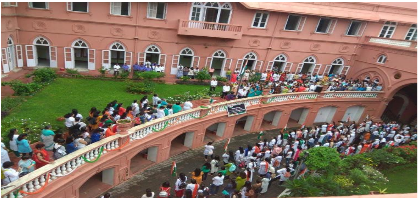
Flag hoisting on the occasion of Republic Day of India (2018)