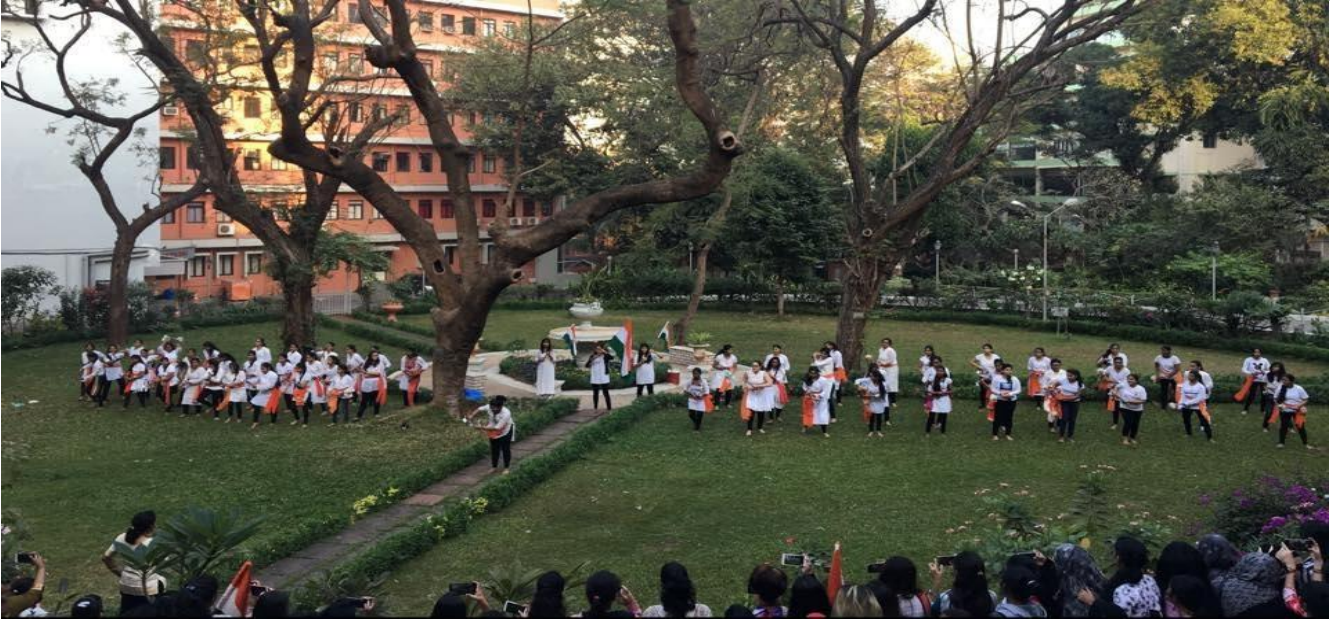
Lezim performance on the occasion of "Independence Day"