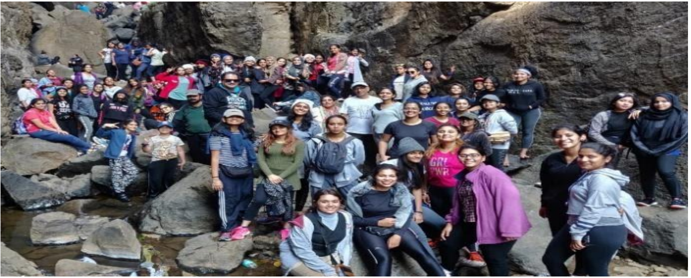
Students at Kolad for Trekking