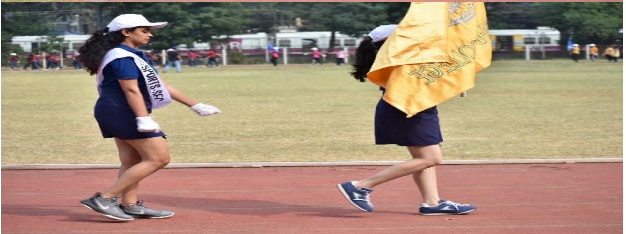
March pass on Annual sports meet at University sports pavillion, Marine lines.