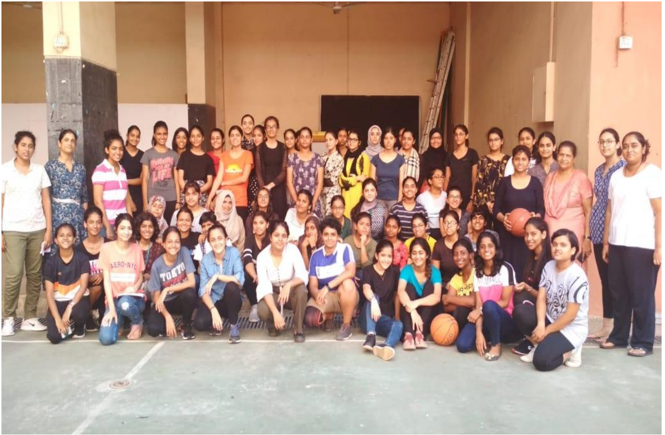
Fitness activity program(2019-20)