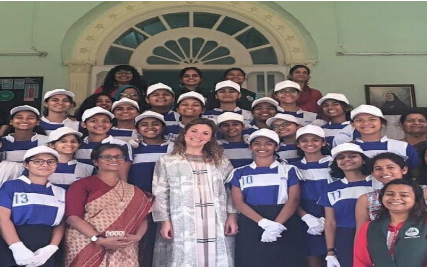
Sophie Gregori Trudeau's (First lady of Canada) visit to Sophia College (2017-18) which was escorted by Sports Dept.