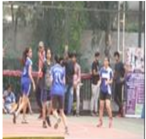
Volleyball team (left) stood second in DSO Inter collegiate competition (2018-19) and Good performance given by our Basketball team(right)