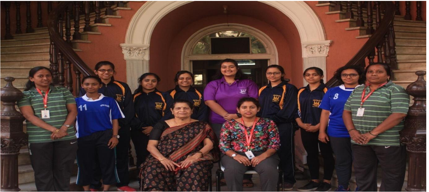
National Level Athletes of the year with the Sports faculty (2018-19)