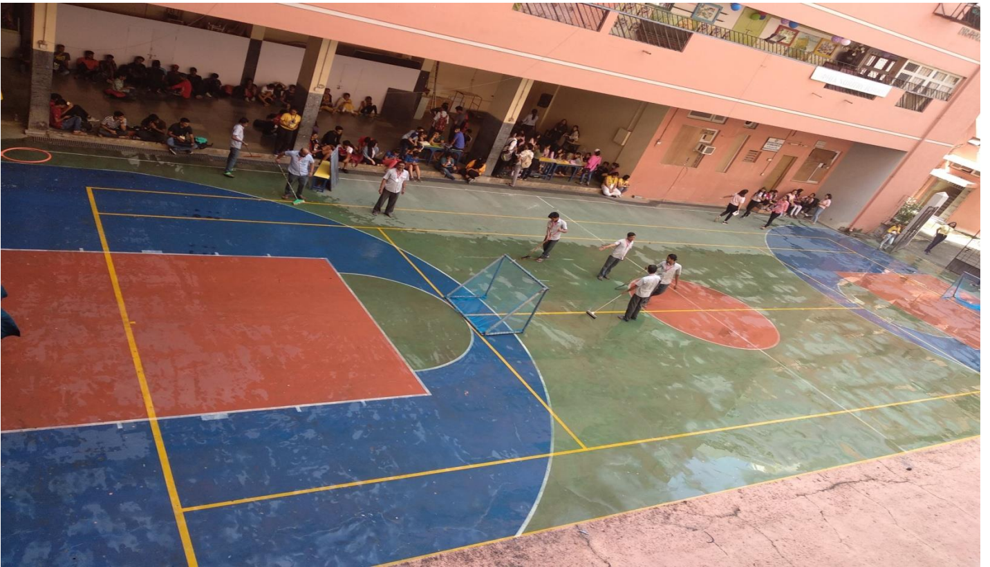
Regular court cleaning by our non teaching staff for practice session