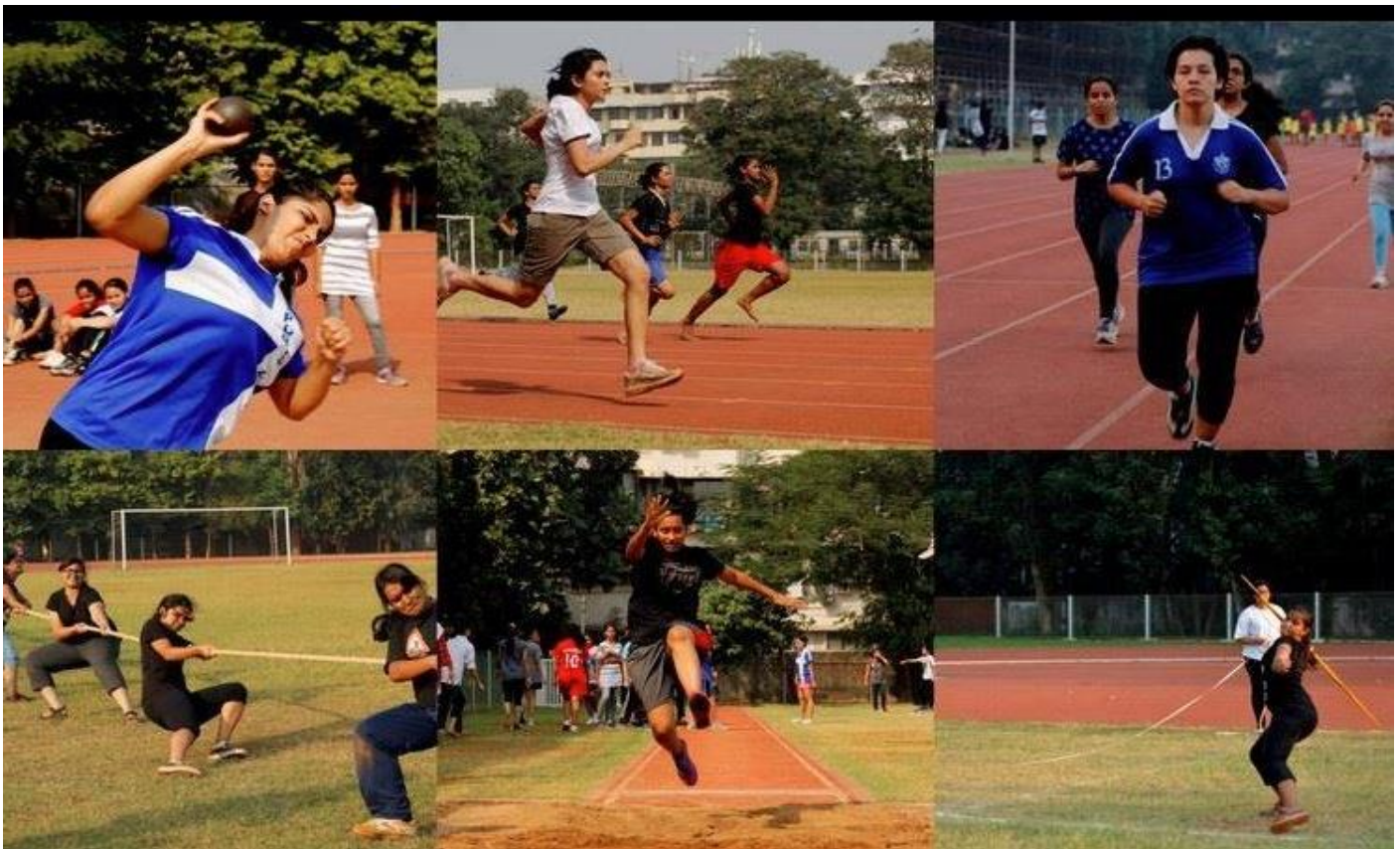
Glimpses of various gymkhana activities (above) and Students were participated in Annual Sports meet(below)