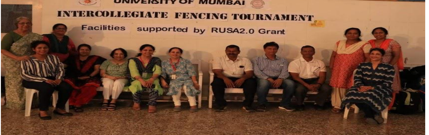
We have Organized University of Mumbai Inter Collegiate Fencing Competition (Men /Women) at campus for three consecutive years. Some pictures with medalist.