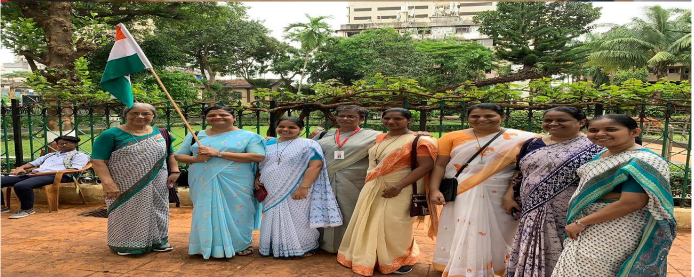
Every year we are organizing Peace March to August Kranti Maidan on Independence Day