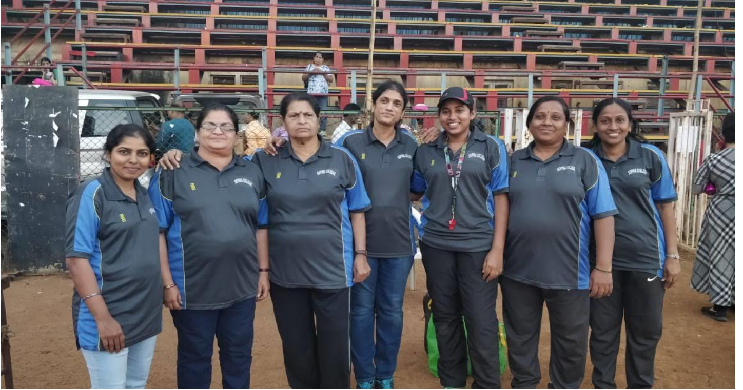
Sports committee members (Teaching staff)