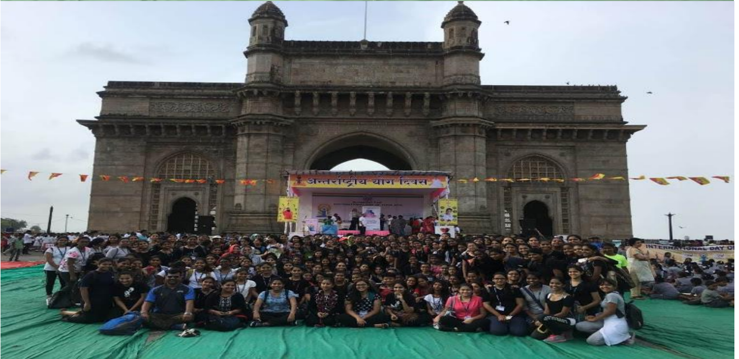
Celebrating International Yoga Day at Sophia College (above) and our college student actively participated in yoga which was organized by DSO of Mumbai city (last)