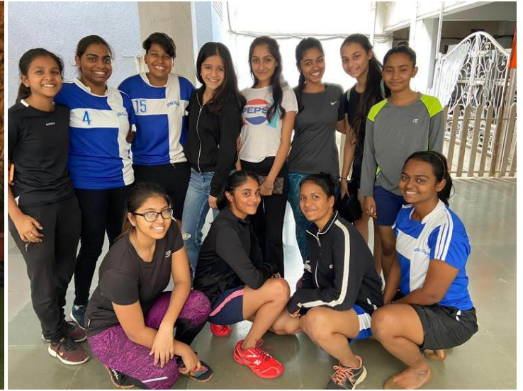
College Badminton and Table tennis team (2019-20)