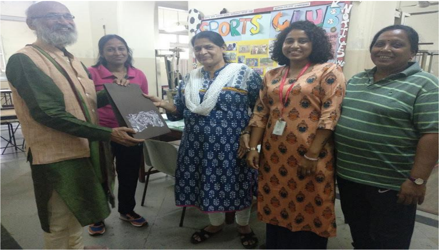
Dadoji Kondadev Puraskar 2003-04" as Best Coach, in Mallakhamb