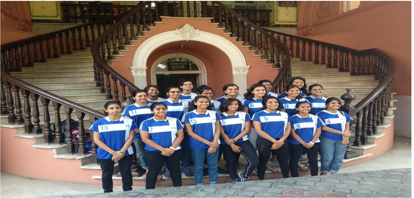
Our athletes of various games such as Badminton, Swimming, basketball etc.